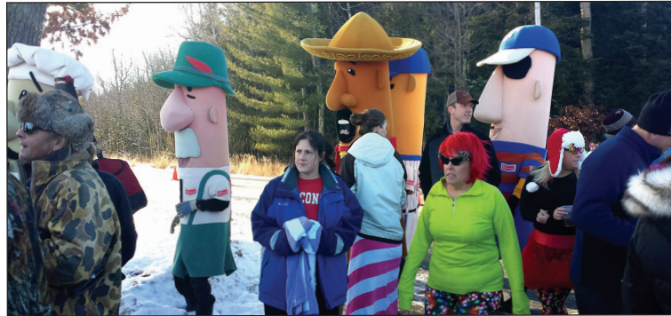
The Famous Racing Sausages made the trip north from the Brewers' Miller Park to participate at the Plunge. From left to right, you've got Brat, Chorizo, Hot Dog and Polish Sausage. Italian Sausage was there but didn't make the picture. He was busy avoiding the hot tubs.

WRJO is now turning its attention to April 1, the date for the inaugural MAN SHOW.