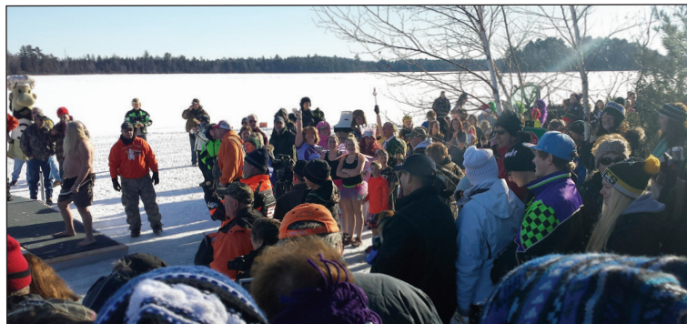
The crowd gathered along the shore of Spirit Lake. We usually have the crowd right on the Plunge site, but couldn't this year because of issues with the quality of the ice.